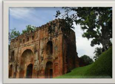
Hide and Seek Doorway