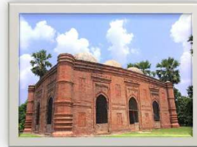
Dhani Chowk Mosque