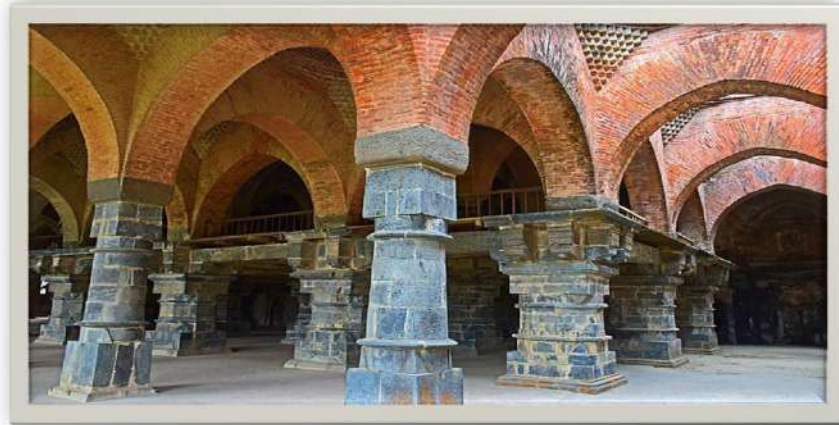
Arches and columns in the interior of Adina Mosque