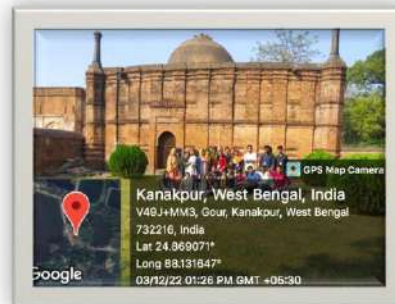
Our Tour team at Hide and Seek Doorway & Du-chala Mosque