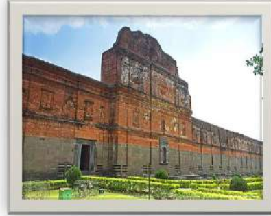
Outside view of Adina Mosque