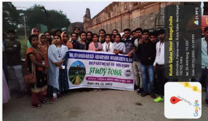
Our Team at Adina Mosque