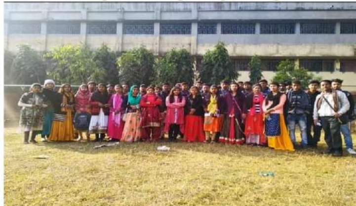
image starting our journey

Place - Lalbagh, Murshidabad, West Bengal