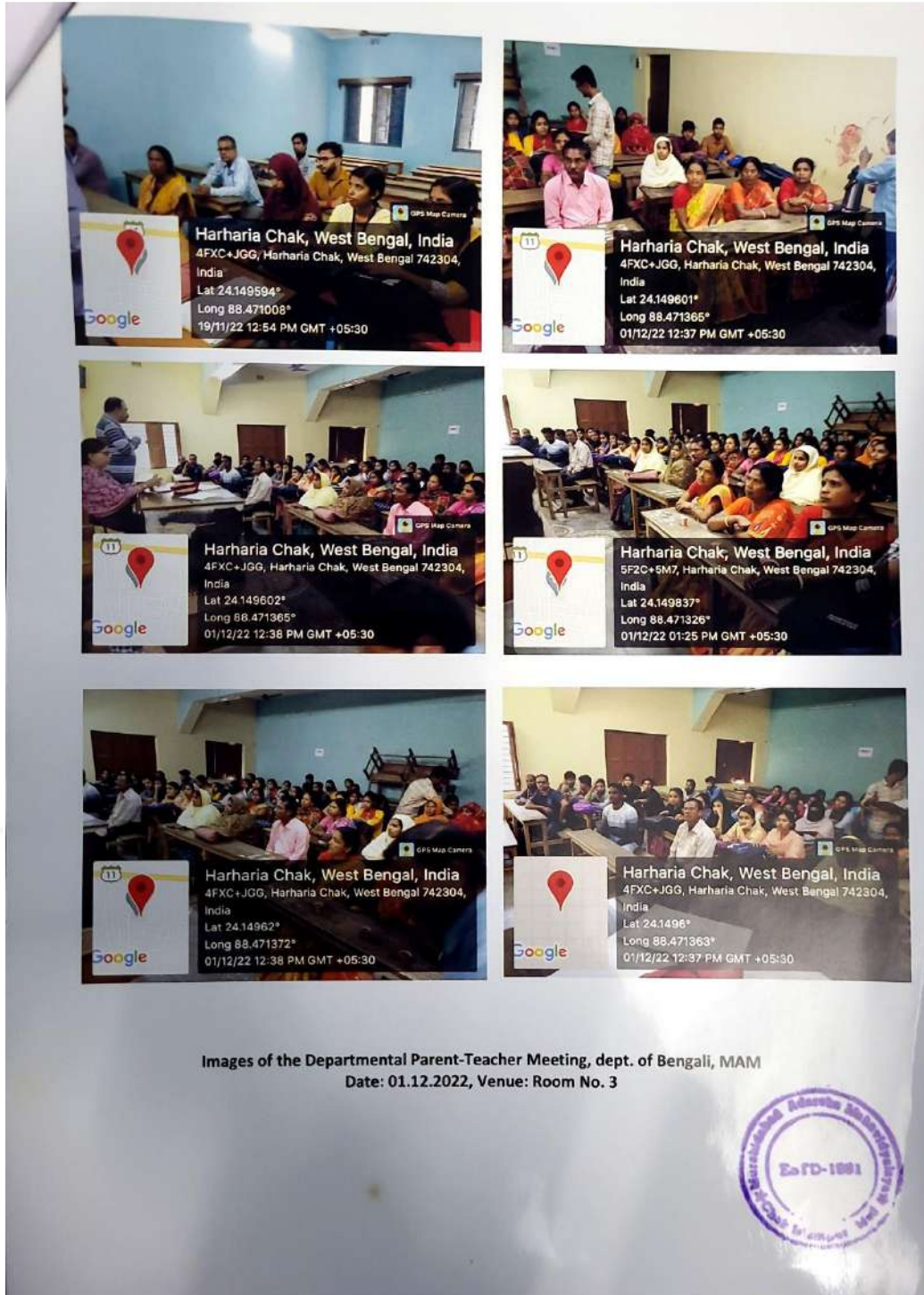
Images of the Departmental Parent-Teacher Meeting, dept. of Bengali, MAM Date: 01.12.2022, Venue: Room No. 3